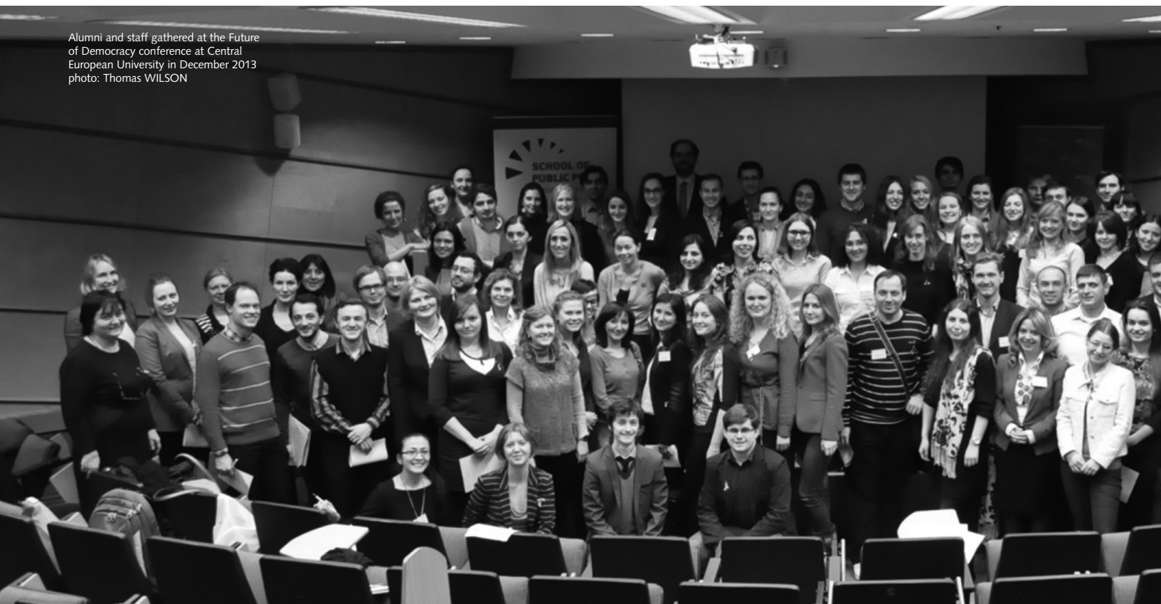
Alumni and staff gathered at the Future of Democracy conference at Central European University in December 2013

The event represented a new model for the Scholarship Programs by placing the strengthening of our engagement with alumni networks in different geographies at the center of the meeting. As recipients of some of the 15,000 scholarships the Open Society Foundations has awarded globally, conference participants had a strong sense of shared goals and values and a strong desire to work together across the network to contribute to social change. ■