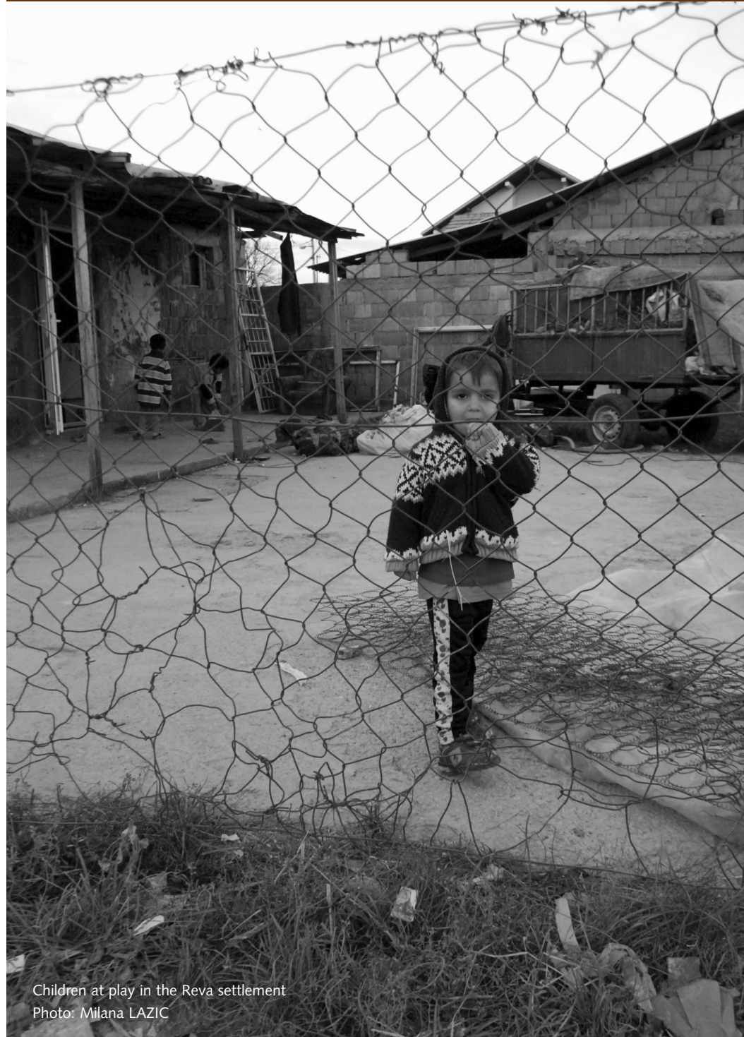
Children at play in the Reva settlement

These photos show the informal and temporary nature of the Reva settlement, located near the Serbian capital, Belgrade. For me, these photos are important, as they illustrate well the isolated, insecure and poor conditions in which many Roma live. This community still has a long way to go to be recognized and included into Serbian society. ■