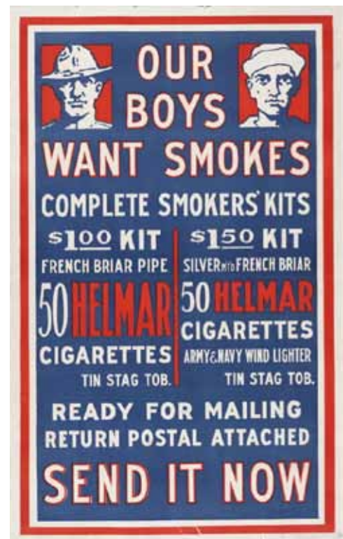
Figure 2: Wartime Tobacco Advertisement