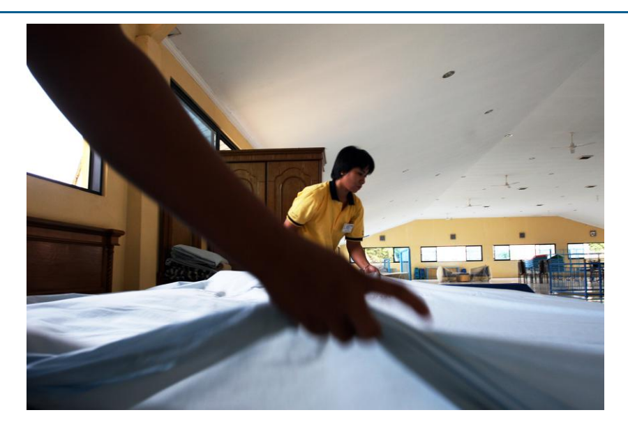
With deft hands, Rubinah made the bed as a professional chambermaid would. She was participating in a training course in Jakarta for employment as a domestic worker in Hong Kong.

Although domestic workers are a vital part of the workforce in many countries, they remain one of the most exploited and least protected groups of workers. Their working hours are among the longest and most unpredictable and, despite some progress in the last decade, they continue to be excluded from many of the basic protections other workers take for granted, such as limits on working hours and minimum wage coverage.<sup>1</sup>