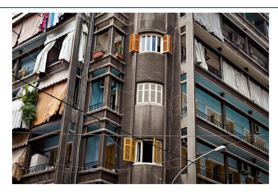
Balconies are often the only form of communication that migrant women have with the outside world. Apartments in the neighborhood of Mar Mikhael, Beirut, Lebanon, 2011.