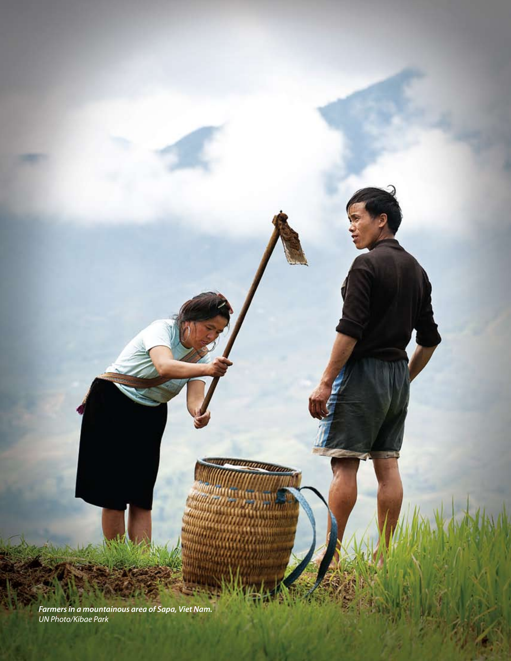
Farmers in a mountainous area of Sapa, Viet Nam.