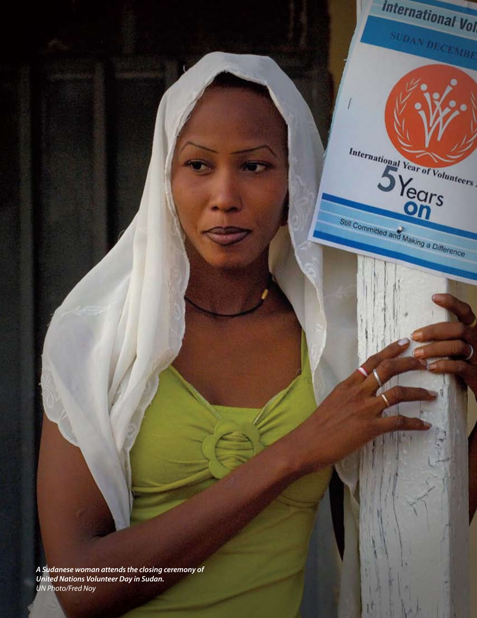
A Sudanese woman attends the closing ceremony of United Nations Volunteer Day in Sudan.