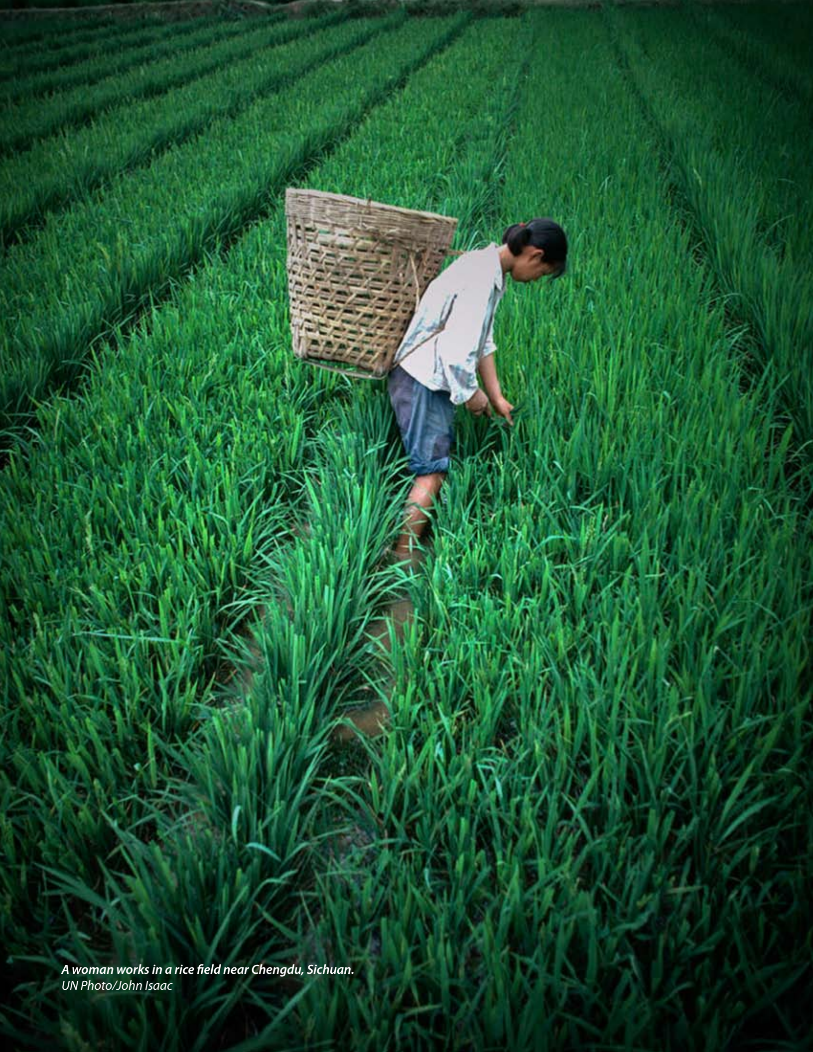
A woman works in a rice field near Chengdu, Sichuan.