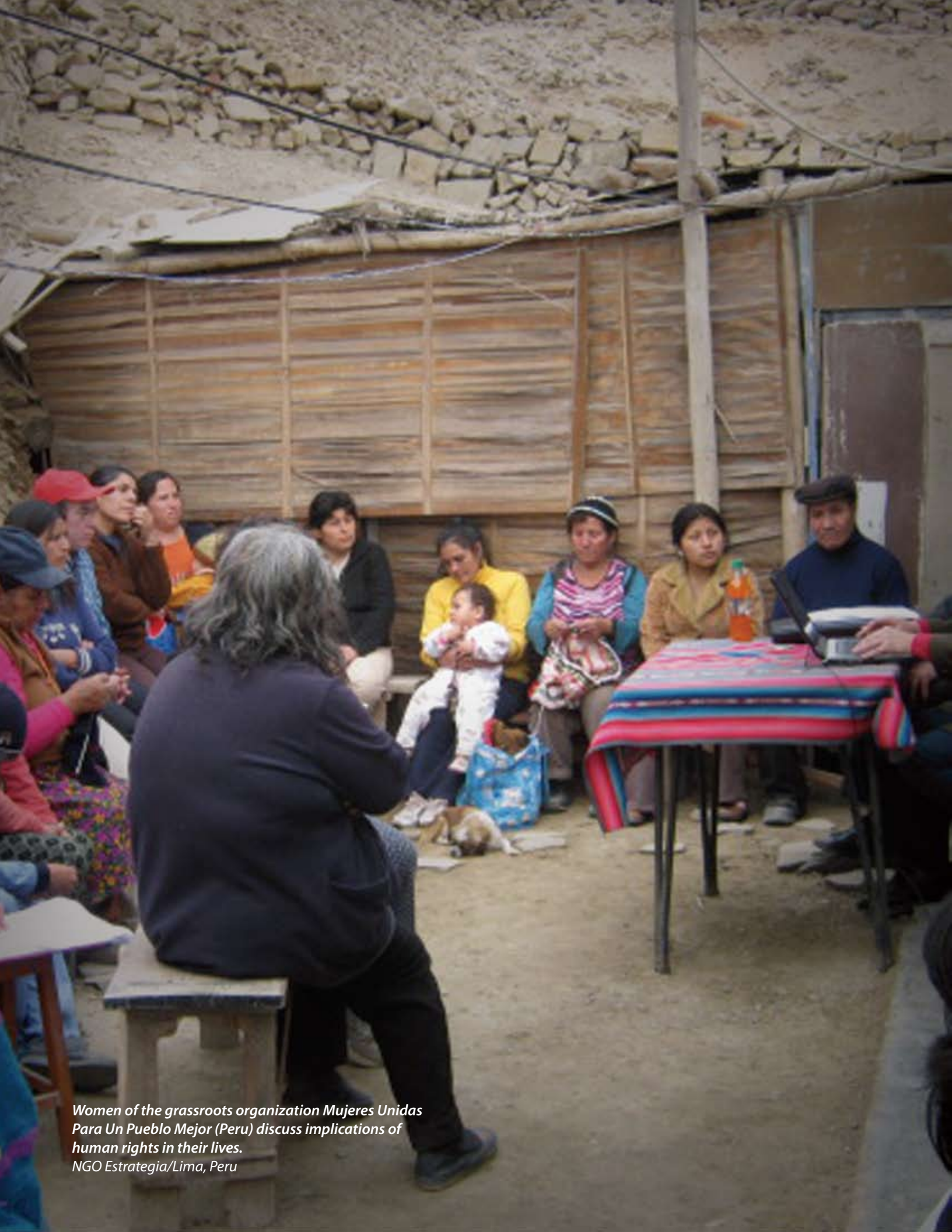
Women of the grassroots organization Mujeres Unidas Para Un Pueblo Mejor (Peru) discuss implications of human rights in their lives. NGO Estrategia/Lima, Peru