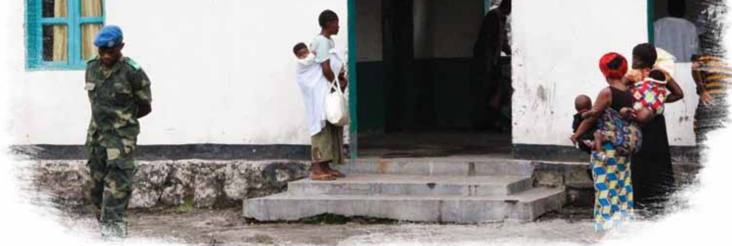
The rudimentary hospital in the camp provides basic medical services to military families.

ARTENARIAT DSS 8 REGION MILITAIRE-UNFPA. BATIMENT CONSTRUIT AVEC L'APPUI DE L'UNFPA Service de Planification Familiale. CPN & CPS