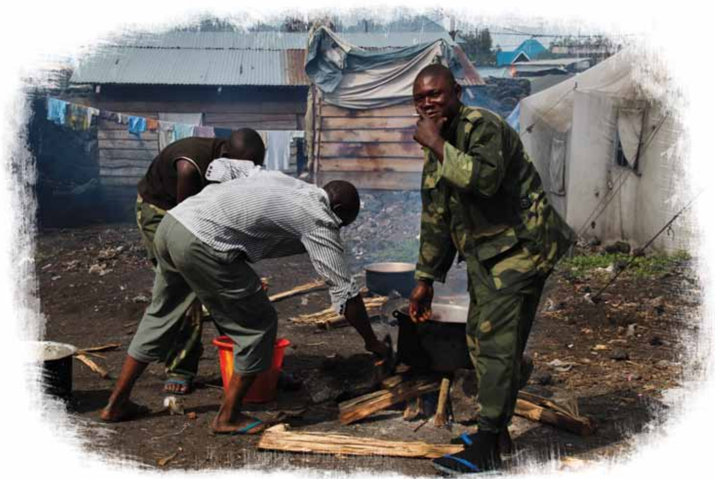
Soldiers cooking their breakfast on a campfire. Many troops are missing basic requirements like military issue boots.