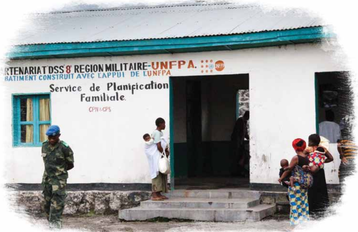
The rudimentary hospital in the camp provides basic medical services to military families.

ARTENARIAT DSS 8 REGION MILITAIRE-UNFPA. BATIMENT CONSTRUIT AVEC L'APPUI DE L'UNFPA Service de Planification Familiale. CPN & CPS