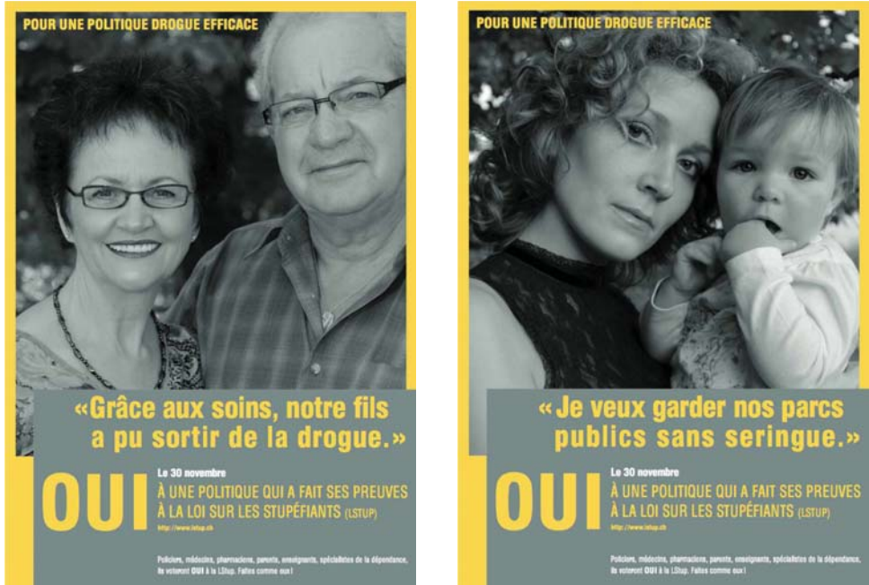
Figure 3: Posters used by the “yes” coalition for the four-pillars referendum, November 2008

The public statements, posters, and media work undertaken by this coalition was a lesson in itself for crafting messages that would resonate with a general, nonexpert public. Two posters that were widely disseminated are in Figure 3 below.