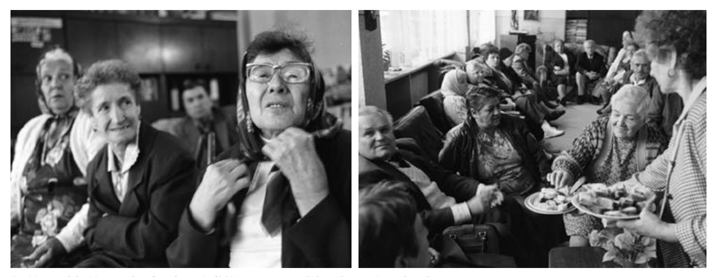
Participants of the Manastur Day Care Center in Cluj-Napoca meet regularly to share stories and snacks.

the home care coordinator for the Foundation for Community Care Services.