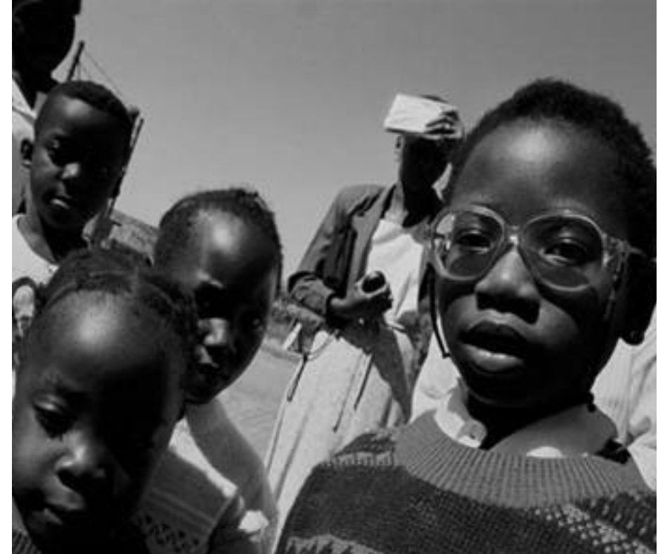
Children in post-apartheid South Africa, like these in the township of Mamelodi, suffer from a lack of basic necessities.

This again emphasizes the need for constructive and creative partnership. The submersion of all intellectual activity in the unmediated utilitarian task of poverty alleviation will impoverish and ultimately destroy that infrastructure and culture. The conduct of a high-minded intellectual life without reference to or concern for the massive sea of poverty surrounding it