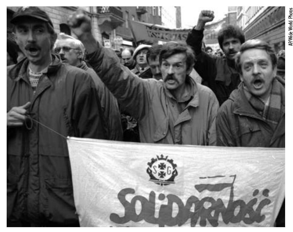
Members of the Solidarity trade union marching in the streets of Warsaw.

Now it is time to move in the direction of public policy, to focus on legal issues that go beyond the protection of human rights. This is a proper target for our work, because implementing the rule of law has turned out to be the most difficult aspect of the post-communist transition. \boxed{>}