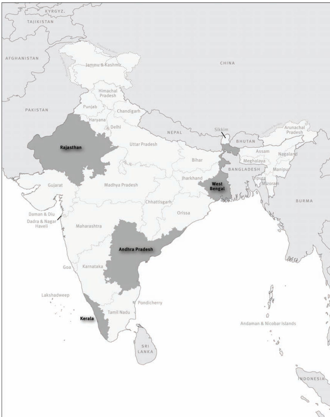
Map 1: States in which Human Rights Watch conducted field research on palliative care