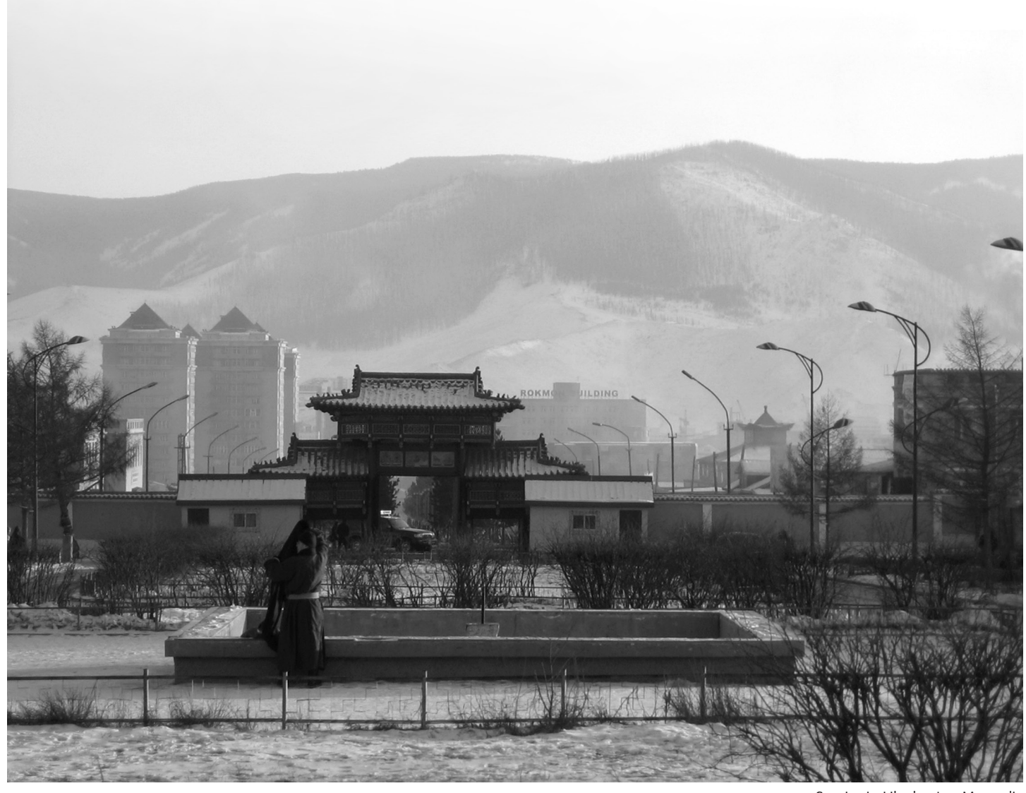
Sunrise in Ulanbaatar, Mongolia