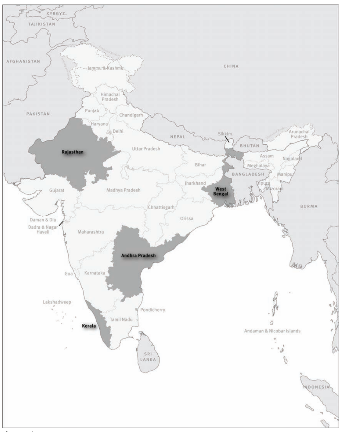
Map 1: States in which Human Rights Watch conducted field research on palliative care