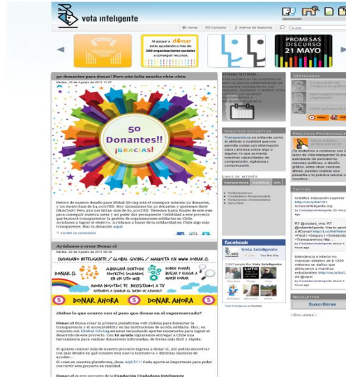
Chile's Vota Inteligente