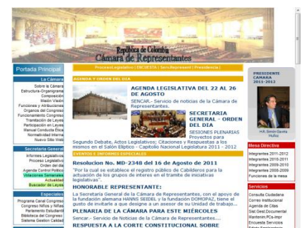
Colombian Chamber of Representatives