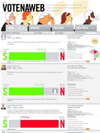
Brazil's Vote na Web

Do the websites of the three PMOs under examination offer substitutes for official parliamentary websites or are they focused on different objectives? The following sections give descriptions of each website, and lay out metrics on internet traffic as well as Google search results and social media.