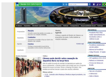
Brazilian Chamber of Deputies

The websites for the lower house of congress are pictured below. As discussed in Part Three, interviews suggest that Brazil and Chile's congressional websites are generally perceived as excellent. The website of Colombia's lower house does not have the same reputation for excellence. One legal consultant 27 simply commented, “information is not easy to obtain on the website.” The 1.0 design of the site suggests a lack of investment. Information seekers claim the Senate website is much more complete and functional. Part of website for the lower house in each country is depicted below.