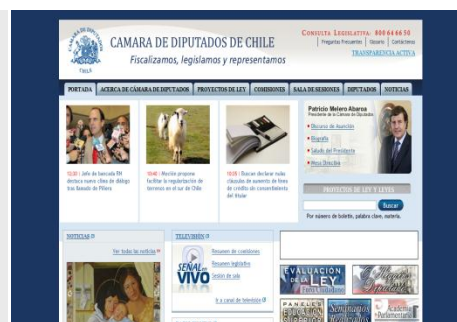
Chilean Chamber of Deputies