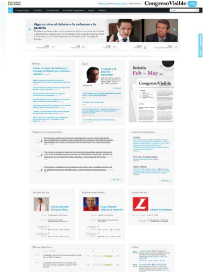
Colombia's Congreso Visible