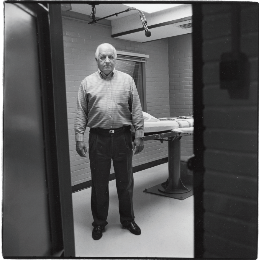
as part of The True Cost of Prison