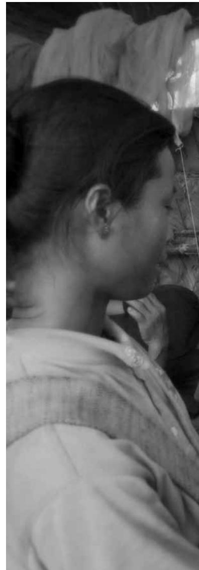
A Karen community health worker administers a blood test

The development of abortion access in Croatia since its legalization until today indicates a clear conservative tendency in terms of reproductive rights. Although the dominant nationalist trend of the 1990s has since receded and childbearing is no longer considered every Croatian woman’s ultimate patriotic duty, the past 20 years have seen radical changes in Croatia’s power structures. With the rise of right-wing politics, the Catholic Church has established itself as an important player whose opinion is always publicized and always seems to matter. While there has recently been no serious attempt to criminalize abortion, it is a threat frequently revived by the Catholic Church, perhaps in an effort to remain relevant in a democratic, post-war, pro-European Croatia. ■