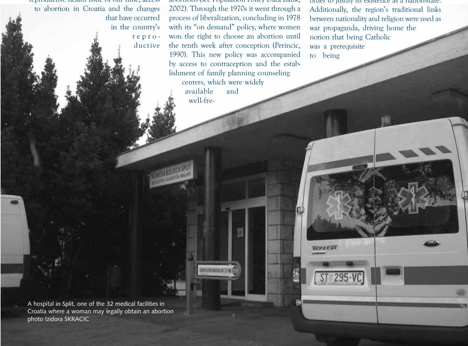
A hospital in Split, one of the 32 medical facilities in Croatia where a woman may legally obtain an abortion

As war broke out and Croatia fought for its independence, the 1990s were marked by extreme nationalist sentiments. Women, as the holders of reproductive potential, were burdened with the responsibility of the nation's cultural and biological continuation in the context of the war and newly acquired independence: fallen soldiers had to be replaced by new sons while the state needed as many Croats as it could find in order to justify its existence as a nation-state. Additionally, the region's traditional links between nationality and religion were used as war propaganda, driving home the notion that being Catholic was a prerequisite to being