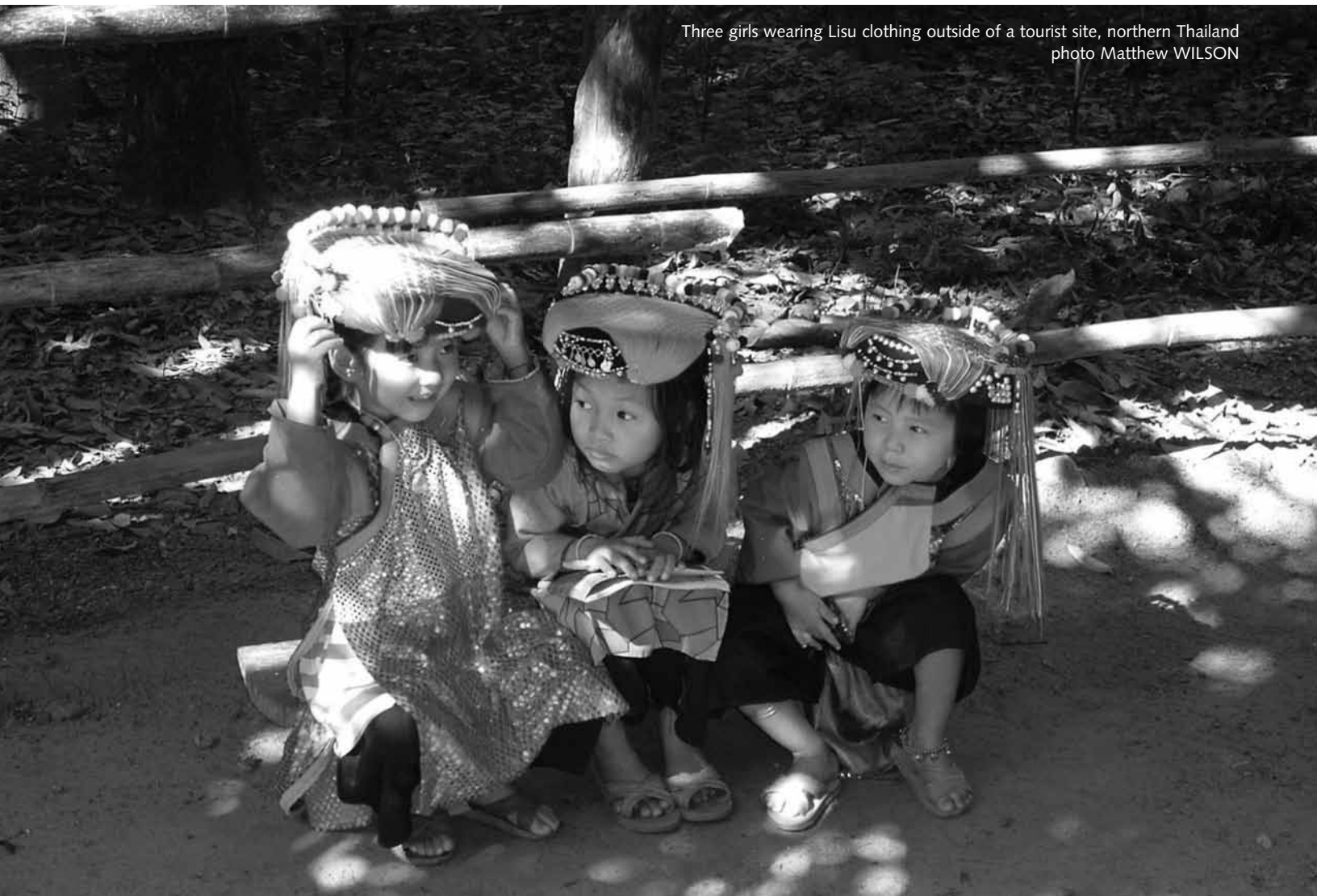
Three girls wearing Lisu clothing outside of a tourist site, northern Thailand

reform must underscore the importance of education in their reform agenda, and provide essential support and assistance. This will revitalize the hope of school age children and young adults, and strengthen their confidence as they work to make Burma prosperous and democratic. ■