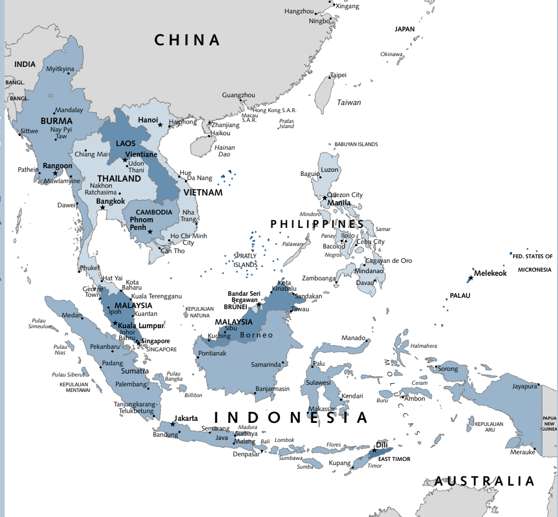
Map adapted from CIA World Factbook. Public domain. Names in Vietnam are shown without diacritical marks.