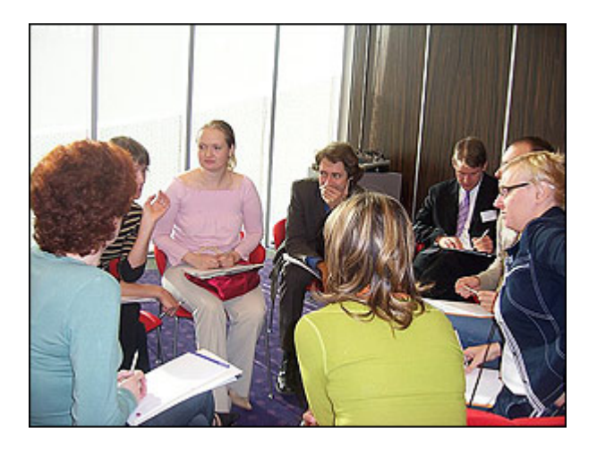
(NSP Alumni in Tallinn)

course, Estonian folk dancing. One Lithuanian alumnus noted that although she lived in the same country as many of her fellow alumni, she hadn't seen most of them since completing her scholarship program.