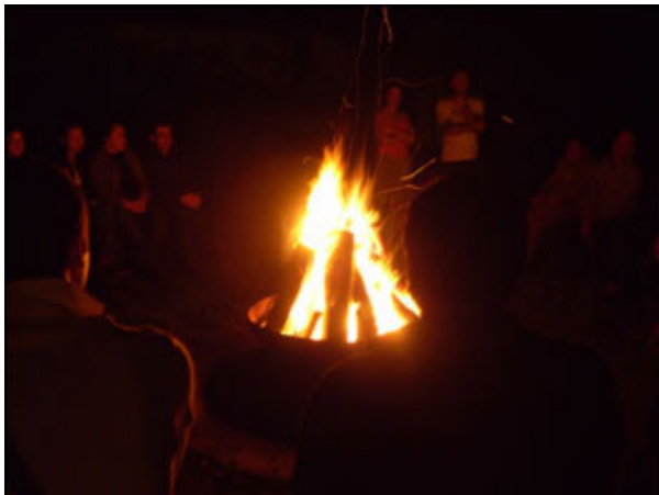
Campfire at the Mückenwirt Beer Garden, Magdeburg.

On a different note, opportunities for social interaction were readily available. In addition to a photograph competition, where grantees displayed pictures taken during their time in Germany, 'Feierabend' events after formal conference activities provided an excellent opportunity to relax and network with fellow scholarship holders. On an early summer's evening, the Mückenwirt Beer Garden on the Elbe River provided the perfect backdrop to socialize, dance and sing around the camp fire until the small hours, while the spectacular 'Colours of Nature' light show on the Millennium Tower at Elbauen Park helped cement new contacts and heralded the close of a successful and highly enjoyable Conference.