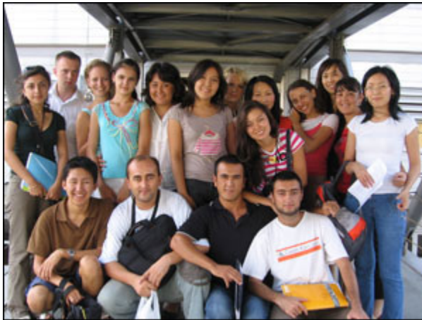
The 2008-9 CNOUS/OSI Fellows.

This year’s grantees are studying in Grenoble, Lille, Lyon, Nancy, Strasbourg, and Toulouse.