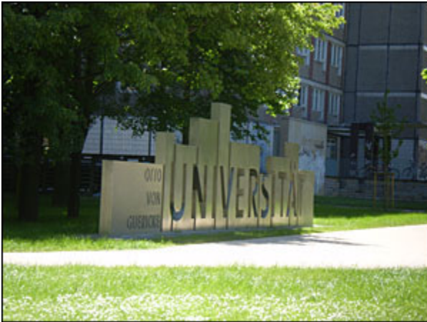
Otto von Güricke University.

Under friendly summer skies, the former GDR city of Magdeburg played host to the 2008 DAAD-OSI Mid Year Conference in late May. This year's event was the biggest to date, with over 130 scholars and guests gathering to take part in working groups, hear presentations and lectures from fellow scholars and guest lecturers, and to enjoy the opportunity to connect with scholars from German universities as geographically-dispersed as Bremen and Constance.