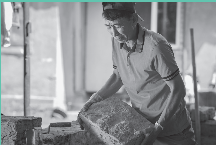
Building homes on land they purchase is popular for migrant workers returning to Kyrgyzstan. This man works on improving his home.