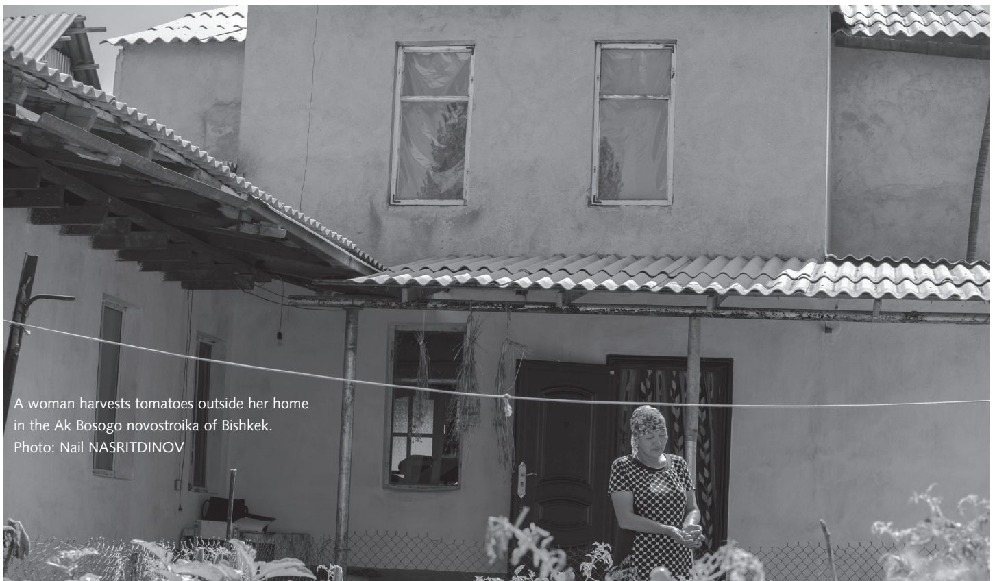
A woman harvests tomatoes outside her home in the Ak Bosogo novostroika of Bishkek.

instead of going back to their towns or villages. They buy plots and build houses in novostroikas, new settlements on the city's periphery, thus contributing to Bishkek's urban expansion. The stories of these migrants are ones of struggle and achievement. For years, these migrants endure hardship and long hours in order to earn money and send it home. A large share of these remittances is spent on the construction of houses. Brick by brick, migrants build their future and solidify their dreams of returning to Kyrgyzstan. The following images I took depict how migrants and their families are using remittances to build their dreams at home from afar. ■