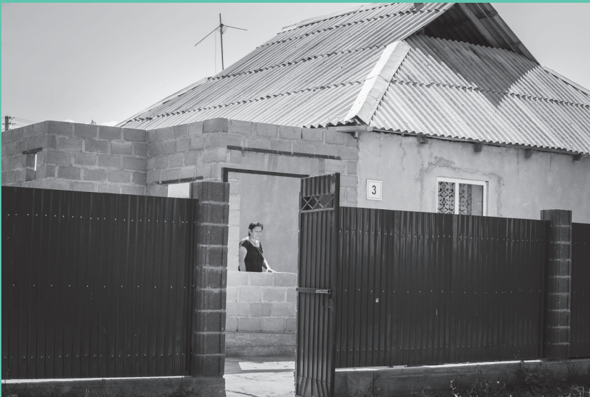
Homes under construction are a frequent site in the Ak Bosogo novostroika, as property in Bishkek is otherwise expensive.