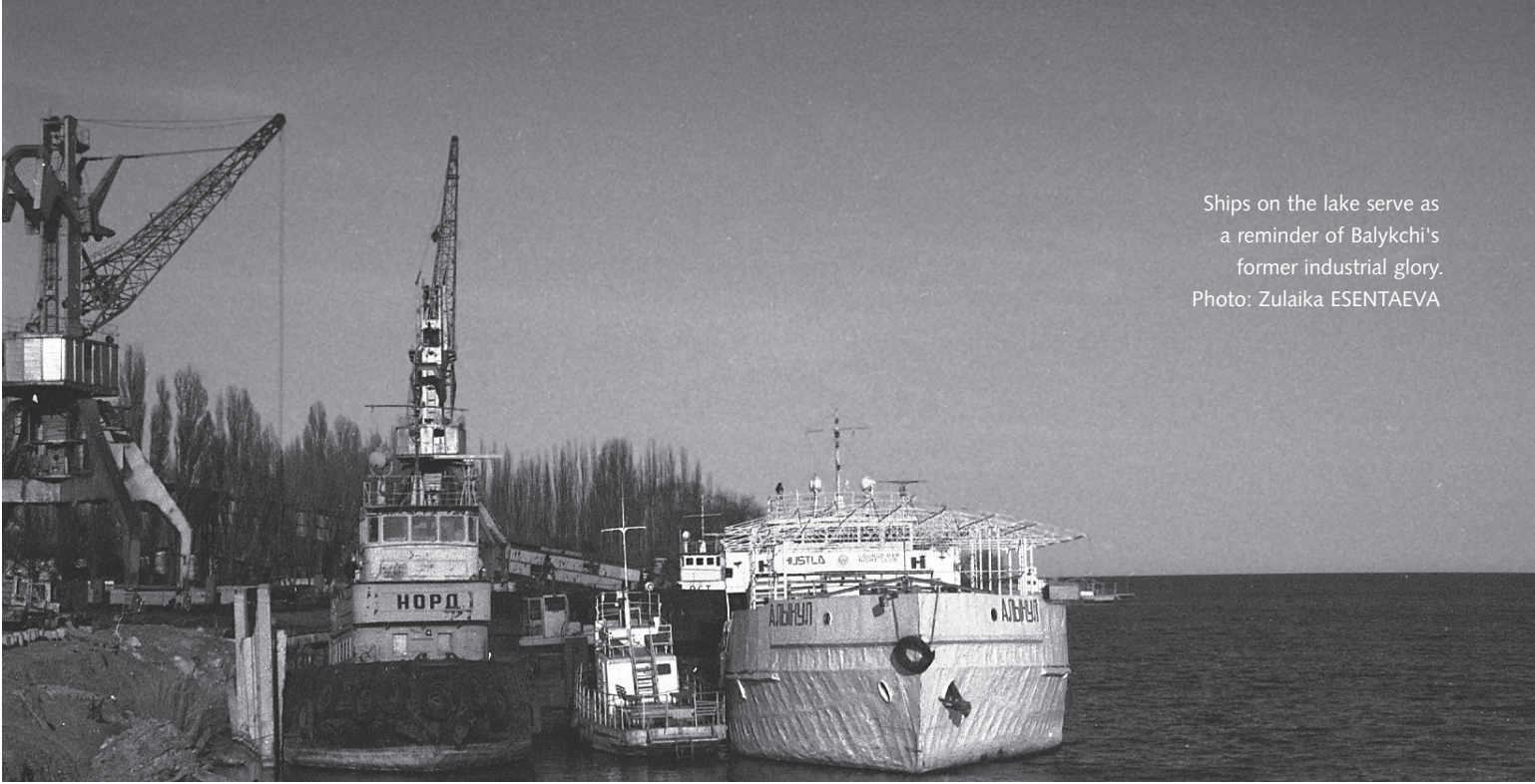
Ships on the lake serve as a reminder of Balykchi's former industrial glory.