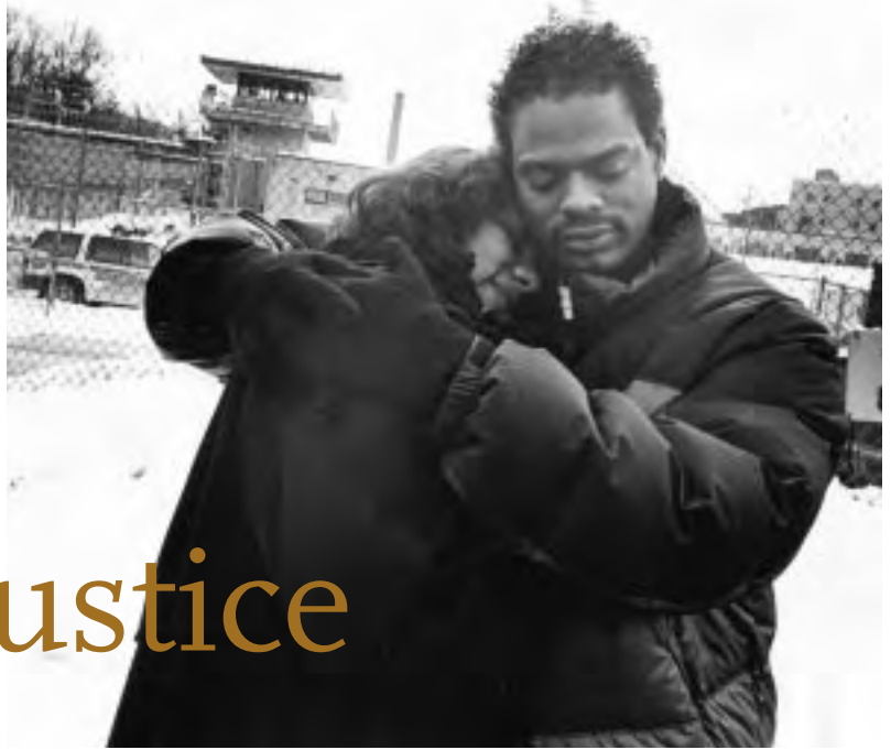
Woman sentenced to 20 years in prison for a first-time drug offense leaves prison early after pardon from New York Governor George Pataki, Bedford Hills, New York, 2000.