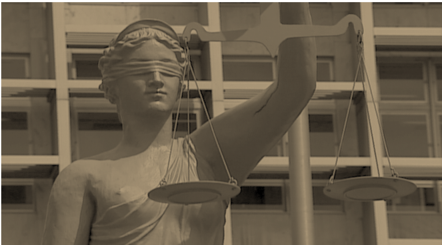
"Lady Justice" statue, United States

“Defendants without resources are no less deserving of rehabilitative treatment than their well-resourced counterparts.”