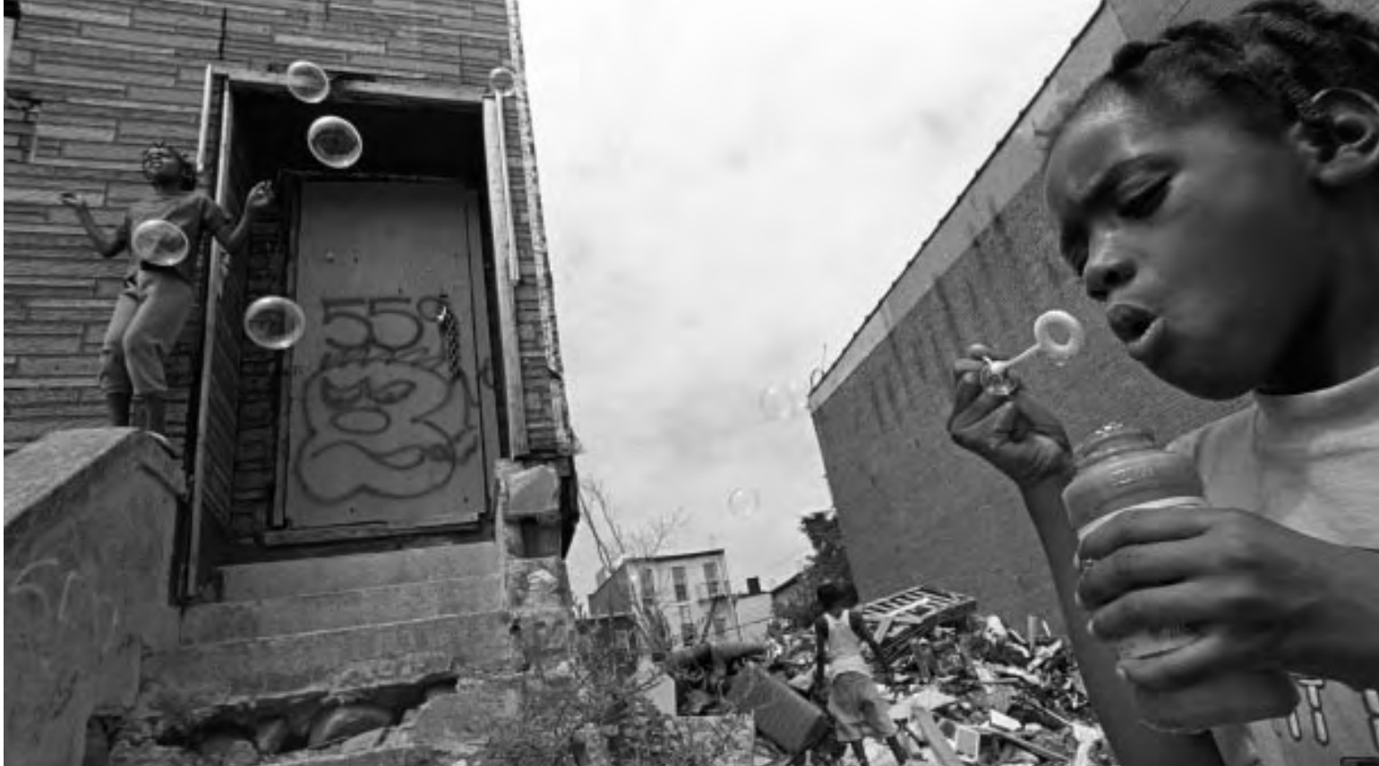
Children play in front of a house slated for affordable housing but eventually bought and sold by a private developer, Brooklyn, New York, 2000.

“The rush of flood waters swept the faces of thousands of poor people—mostly black—onto TV screens across the world, challenging notions of a uniformly prosperous and inclusive America in which race was no longer significant.”