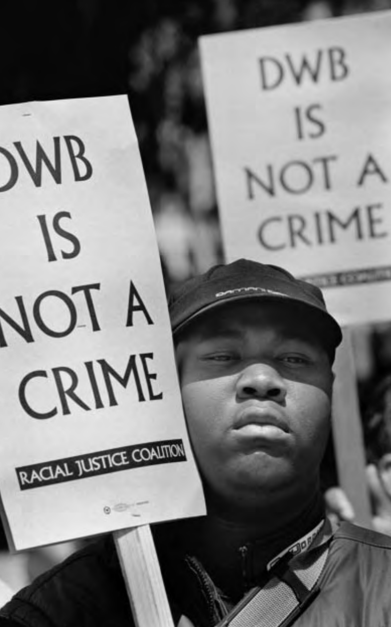
Demonstrator at a rally against racial profiling. “DWB” stands for “driving while black or brown,” Sacramento, California, 2000.

Yet, many studies have concluded that African Americans and Hispanics use drugs no more than anyone else relative to their percentage of the population, and transport drugs much less than their white counterparts.