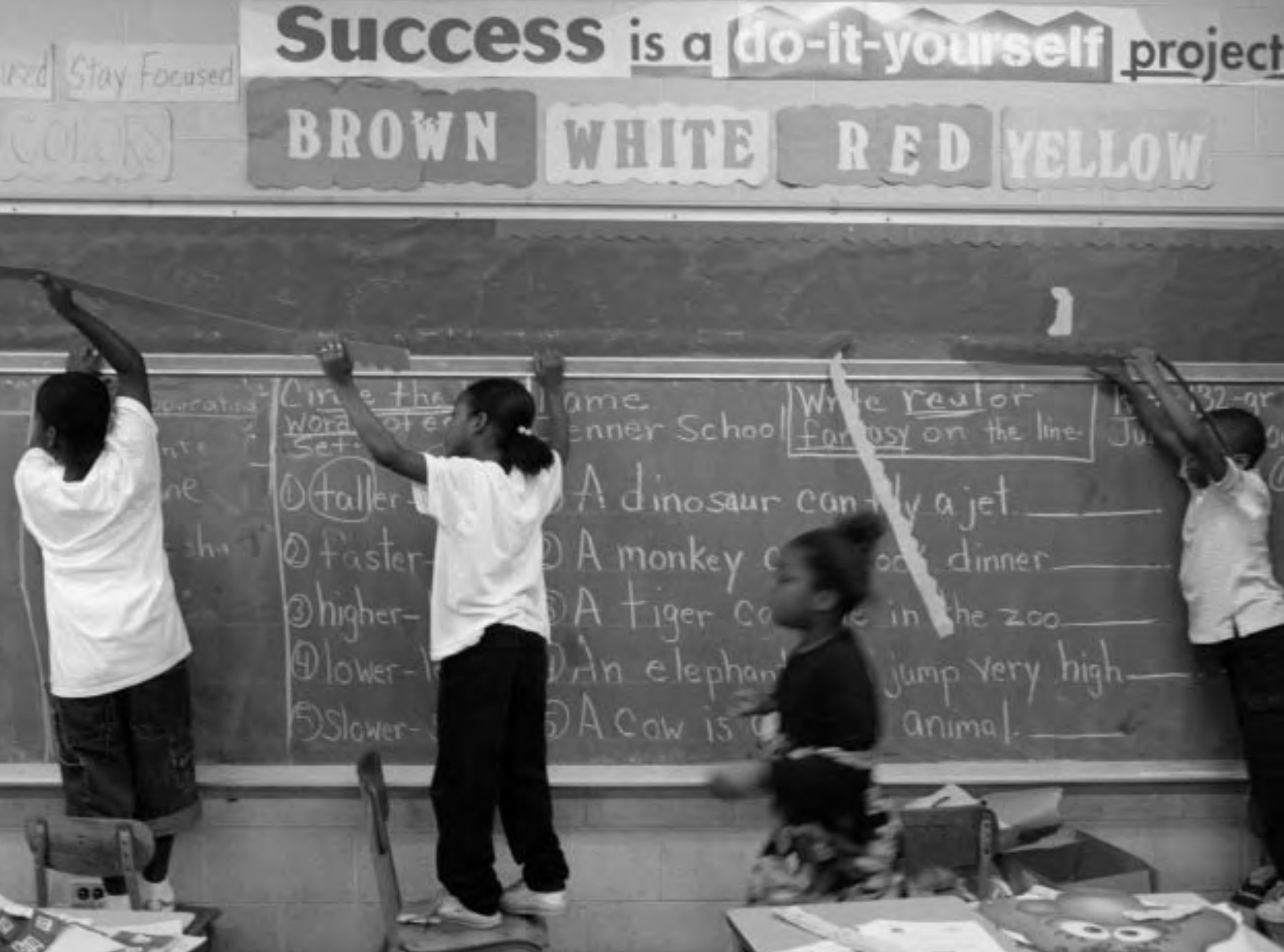
Elementary school students prepare their classroom for move to new school, Chicago, Illinois, 2000.