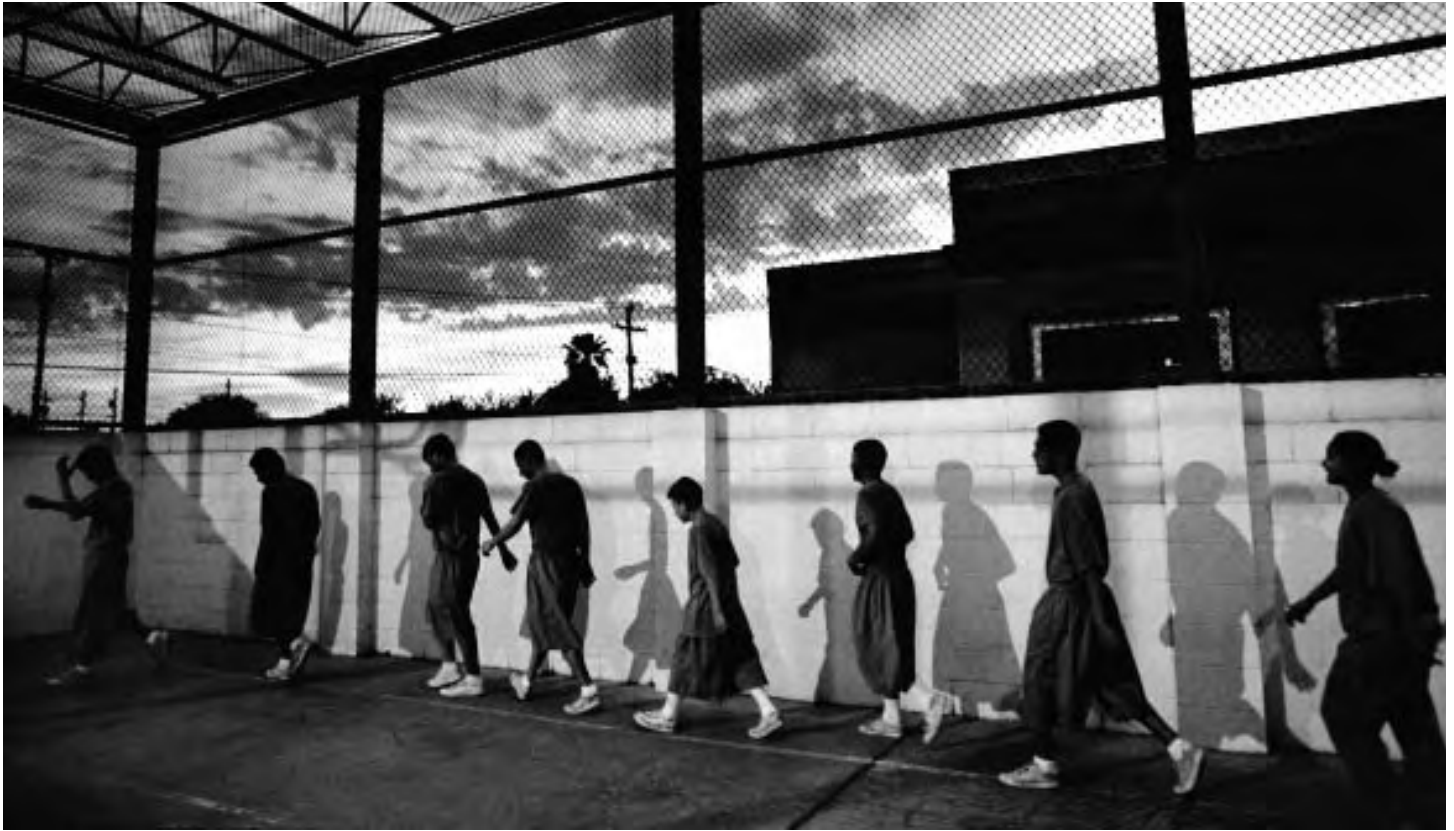
Young inmates in the yard of a juvenile detention facility, Laredo, Texas, 2003.

“The official response to juvenile justice issues has increasingly become one of incarcerate first, provide services later.”