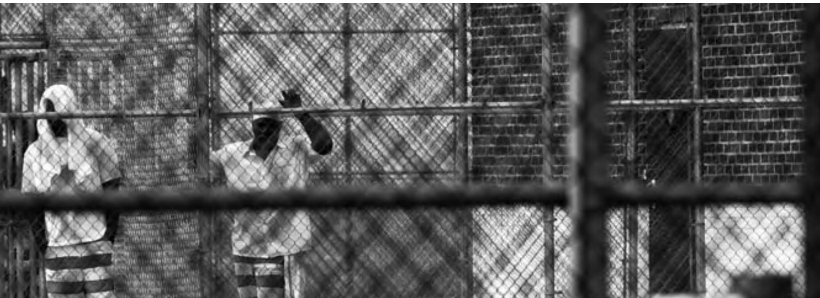
Maximum security inmates peer through prison fences, Parchman, Mississippi, 2002.

“Inflated populations created by prisons increase representatives’ power; giving them little incentive to reduce the numbers of people sent to prison and the length of time they spend there.”