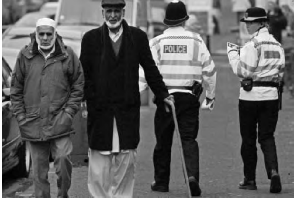
Police officers conducting outreach efforts after police raids in Muslim community in response to alleged kidnapping and execution plot, Birmingham, United Kingdom, 2007.